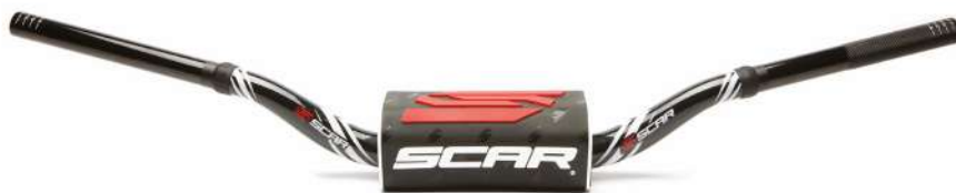
BLACK GRAPHIC COLOUR