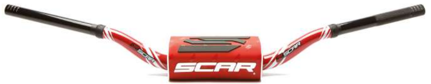
RED GRAPHIC COLOUR