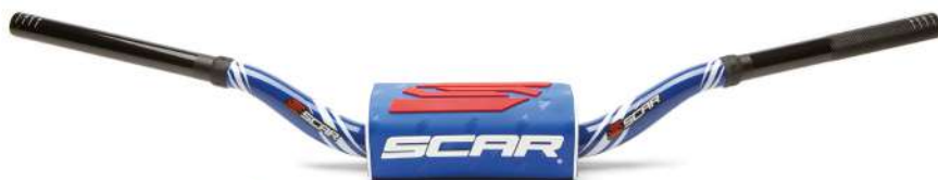
BLUE GRAPHIC COLOUR