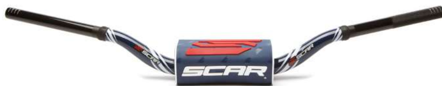
DARK BLUE GRAPHIC COLOUR