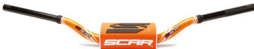
ORANGE GRAPHIC COLOUR