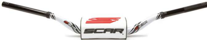
WHITE GRAPHIC COLOUR